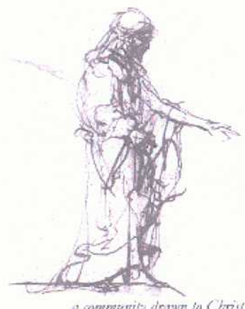
a community drawn to Christ

We offer spiritual direction and various resources for individual spiritual growth to all who desire encouragement. We also represent a community of faith that meets regularly for fellowship and support.